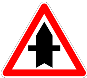
One Time Priority

Yes, even if they drive too fast and you feel that your road is a priority road. You can find those signs in towns as well so always be aware.