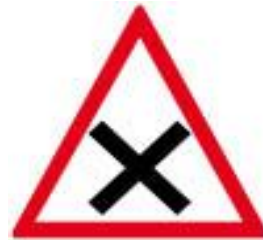
Crossroad with right-of-way to the right